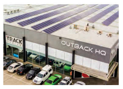
TRACK FACTORY AND Melbourne outlet outback HQ

From humble beginnings we have climbed to heights none of us could have imagined. We have endured and 'made hay' on the economic swings and roundabouts and continuously innovated, inspiring our customers and competitors alike.