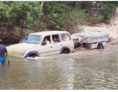
TRACK TRAILER EAGLE CAMPER