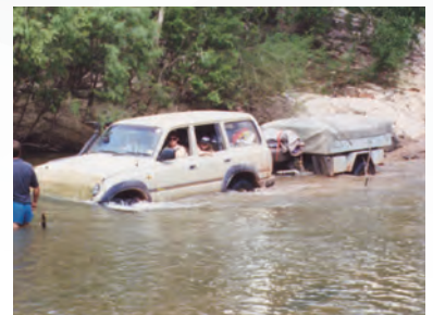
TRACK TRAILER EAGLE CAMPER