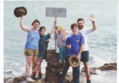
WALDRON FAMILY - CAPE YORK