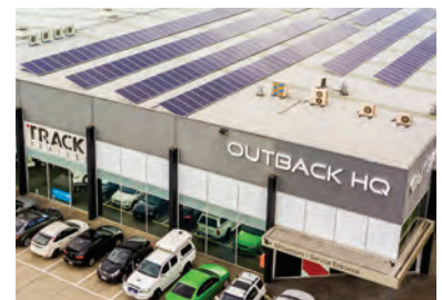
TRACK FACTORY AND MELBOURNE OUTLET OUTBACK HQ